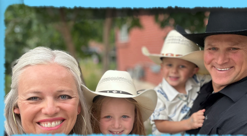
Our family dressed up for our neighbors Quinceañera! It was an honor to be part of their celebration!