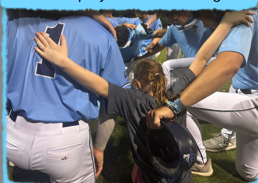
Peets and Lester including Eve' with the Scouts prayer time after the game!