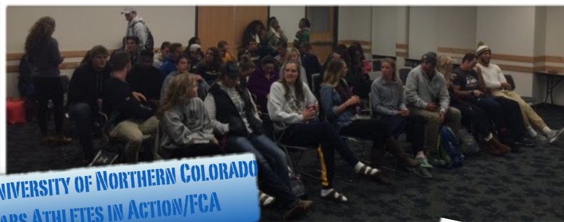
UNIVERSITY OF NORTHERN COLORADO BEARS ATHLETES IN ACTION/FCA