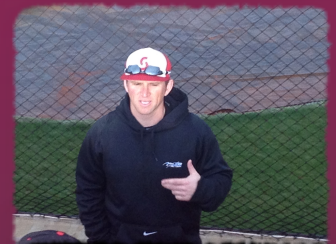
One of several team talks from the trip.