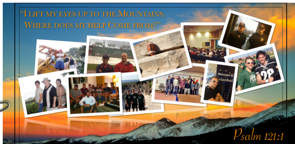
A recap of some of the blessings of 2013! Thank you Jesus for being our help!