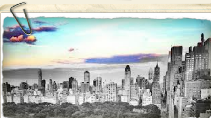
The scope is college athletes in the NYC Metro Area!

Make a return trip to do a SALT retreat (Student Athlete Leadership Training) for identified leaders on multiple campuses in the area to empower and equip.