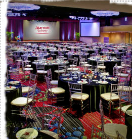
Super Bowl Breakfast!

Our strategy is to use the platform of the Super Bowl Breakfast (SBB) as a tool to leverage our visit on NYC campuses to launch sustainable movements on college campuses.