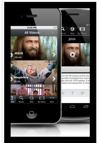
Download Jesus Film Media App Free