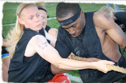
There is a tug-a-war for their souls!